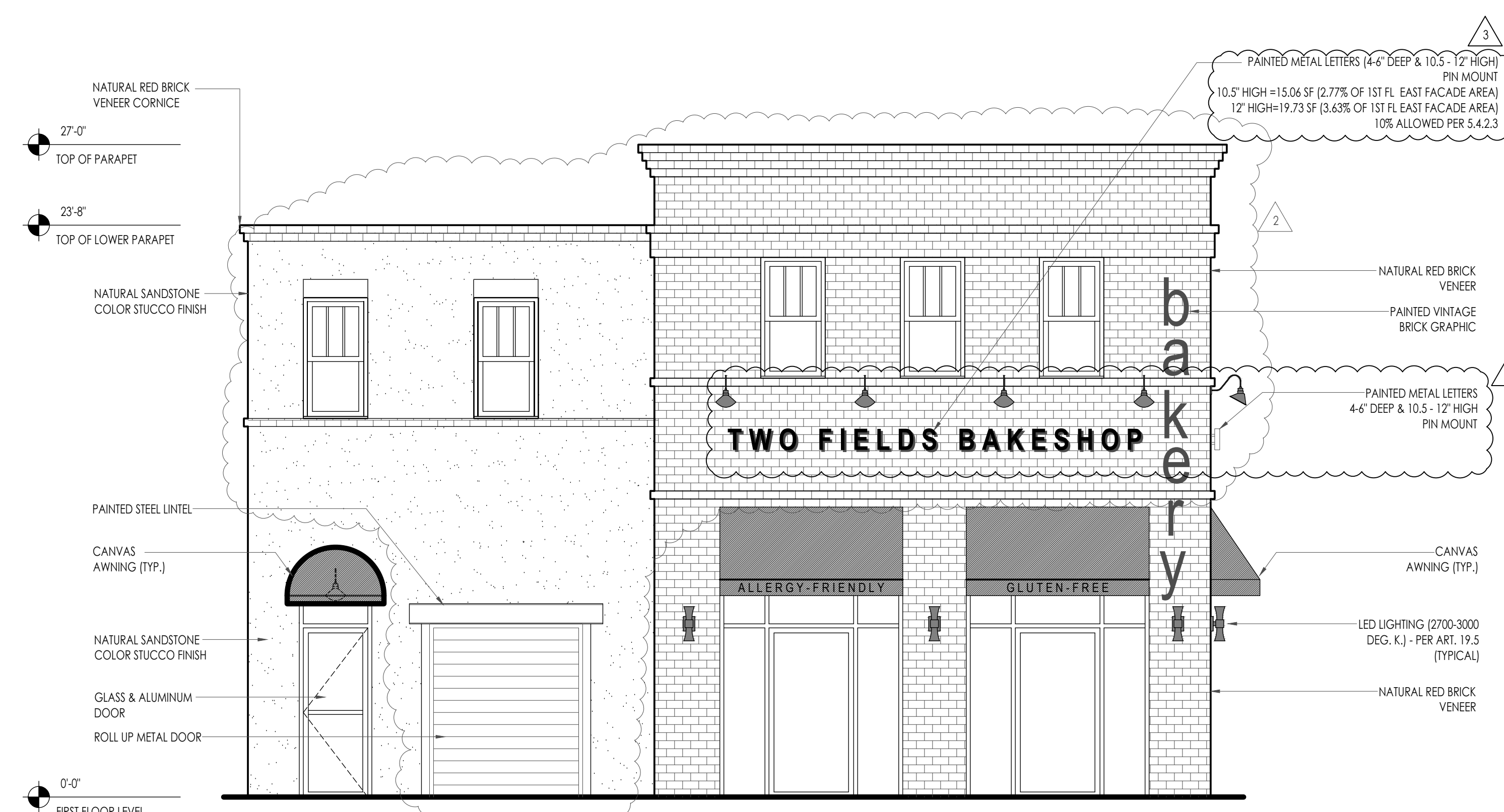
J-11 EAST ELEVATION SCALE: 1/4" = 1'-0"