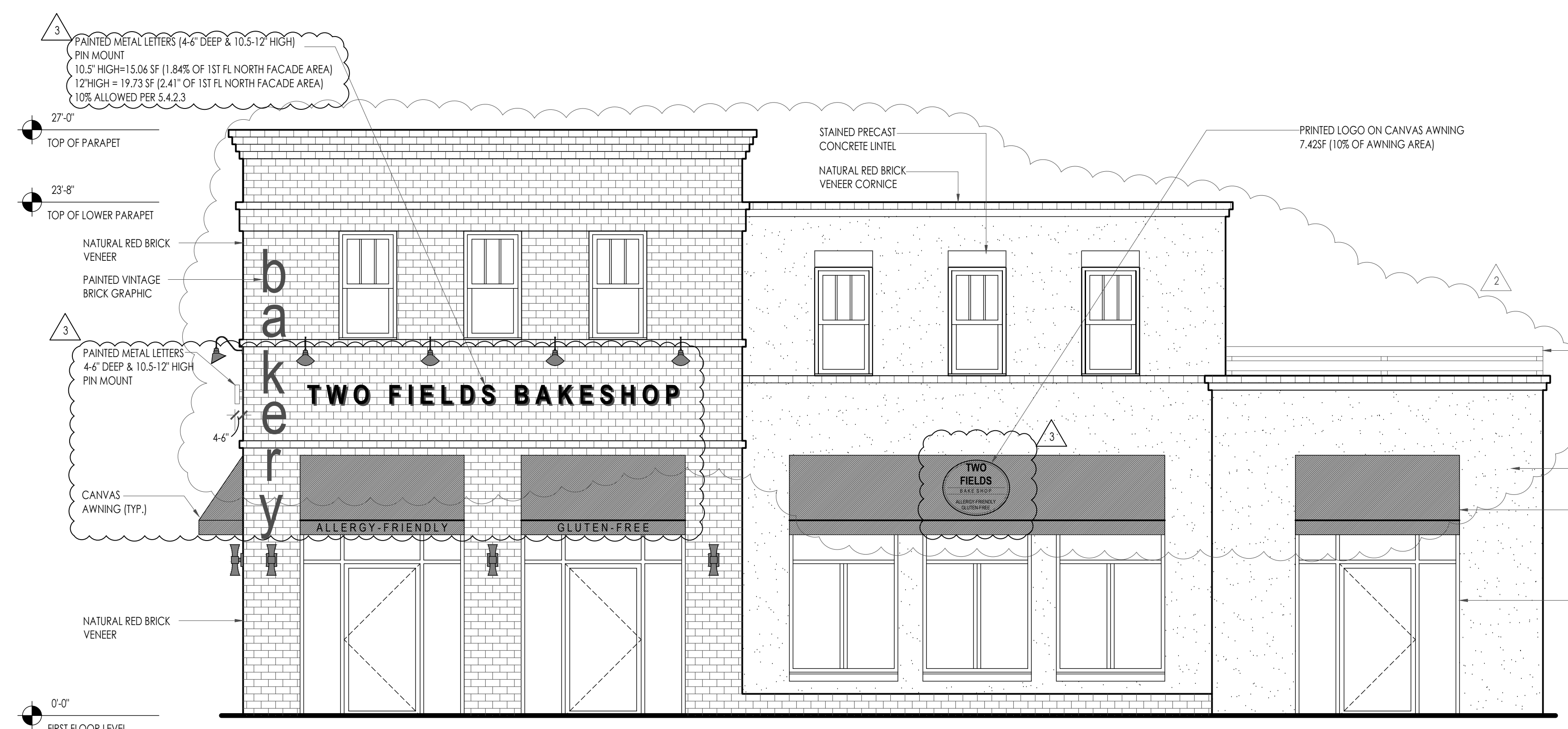
J-1 NORTH ELEVATION SCALE: 1/4" = 1'-0"